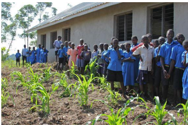
Picture: Many schools in Africa have a school garden

Before the end of the year a request by Agromisa to Wageningen University and Research (WUR) for an Academic Consultancy Training (ACT) group was approved. A group of 7 students from 5 different study background and 5 different nationalities got organised to spend nearly 3 months in early 2014 to make a design for a 'permaculture' school farm in Uganda for learning and income-generation purposes at Hoys College secondary school in Bukomansimbi district.