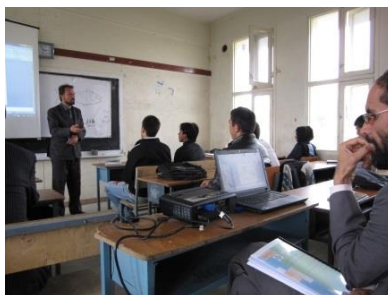
Visiting Agricultural high schools in Afghanistan